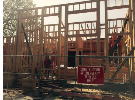
Future Home of Kent Admin and Health Office

campus, and the music classroom toward the east side. Modernization of classrooms that was scheduled for the summer has all been completed. Architectural plans for Bacich's projects are being submitted to the state architect for review in the next few weeks.