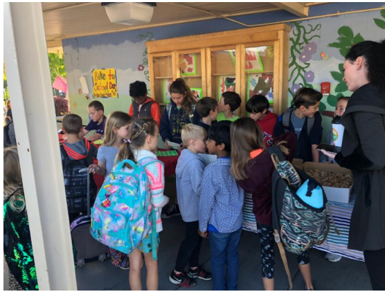
Bacich students enjoy morning treats from Rustic Bakery and Peets.

On Wednesday, May 9, 2018 hundreds of Kentfield students walked and rolled to school to celebrate National Bike to School Day.