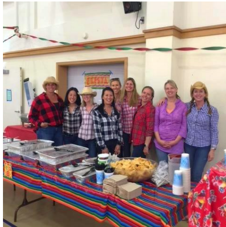
Rancho Day Volunteers

Whether you volunteer at Fun Lunch, Car Line, shelve books in the library, fill Friday folders, bring snacks for a holiday celebrations or serve on our PTA or Site Council, we appreciate you!