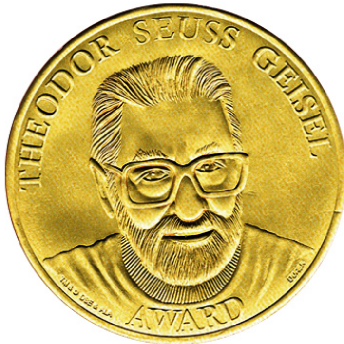
Theodor Seuss Geisel Award

Congratulations to the winners of 2020 book awards!