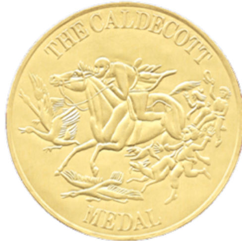
The Caldecott Medal

The Caldecott Medal was named in honor of nineteenth-century English illustrator Randolph Caldecott. It is awarded annually by the Association for Library Service to Children, a division of the American Library Association, to the artist of the most distinguished American picture book for children.