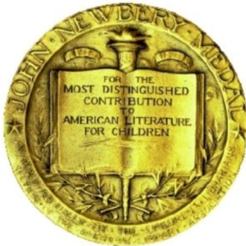
The Newbery Medal

Originally performed for ESPN's The Undefeated , this poem is a love letter to black life in the United States. It highlights the unspeakable trauma of slavery, the faith and fire of the civil rights movement, and the grit, passion, and perseverance of some of the world's greatest heroes. The text is also peppered with references to the words of Martin Luther King, Jr., Langston Hughes, Gwendolyn Brooks, and others, offering deeper insights into the accomplishments of the past, while bringing stark attention to the endurance and spirit of those surviving and thriving in the present. Robust back matter at the end provides valuable historical context and additional detail for those wishing to learn more.