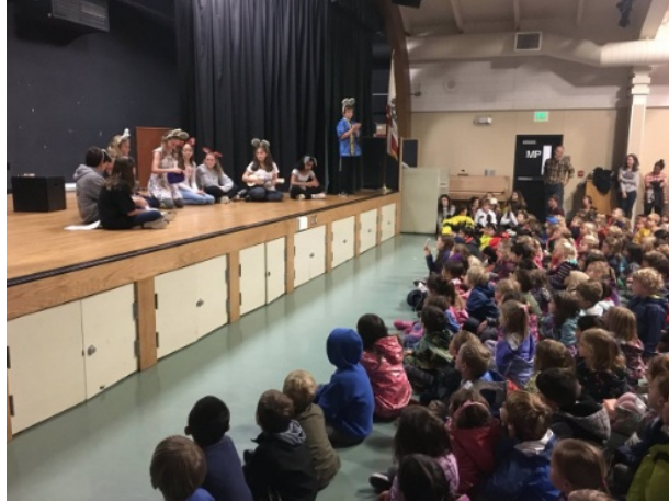
November Performance at Kent

Last week, 7th grade Service Innovation students visited Bacich to perform several skits about respect. This aligned with Bacich's literary focus of the book "Lilly's Purple Plastic Purse" by Kevin Henkes. In November, Bacich students visited the Kent Middle School campus for a performance of "Lilly's Purple Plastic Purse" by 7th grade students. Students handed out tokens of appreciation to each student to pass to someone who was being respectful.