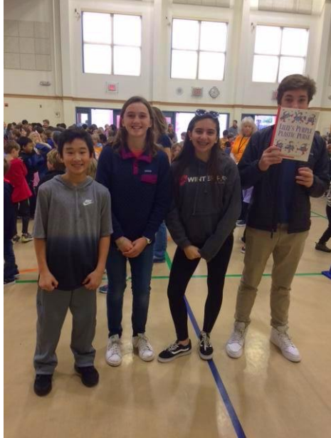
January Project at Bacich